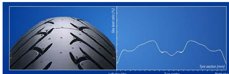
Fig. 3: Land Sea ratio

conditions, the performance equilibrium that inspires the ROADTEC Z6 INTERACT™ in all its aspects is manifested in perfect combination between sports grip and mileage, within the logic of the use of a Sport-Touring bike.